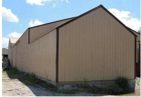
Free Standing Pole Barn 6,000 sq. ft. — 18' Ceilings, 6" Concrete Floor Attached 4,000 sq. ft. free standing Pole Barn — 20' Ceilings, 6" Concrete Floor