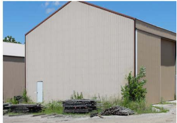
3-Out Buildings 2—4,000 sq. ft. 20' ceilings, rock floor 1—6,000 sq. ft., 20' ceiling, rock floor